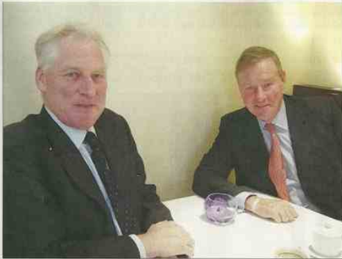
The Class of '70 - Oriol and St Catz

G ood, we've got a red light, so first of all, congratulations from our President and Chairman, from me, from the Society, from our members and from our readers of Pennant. What are the first impressions?