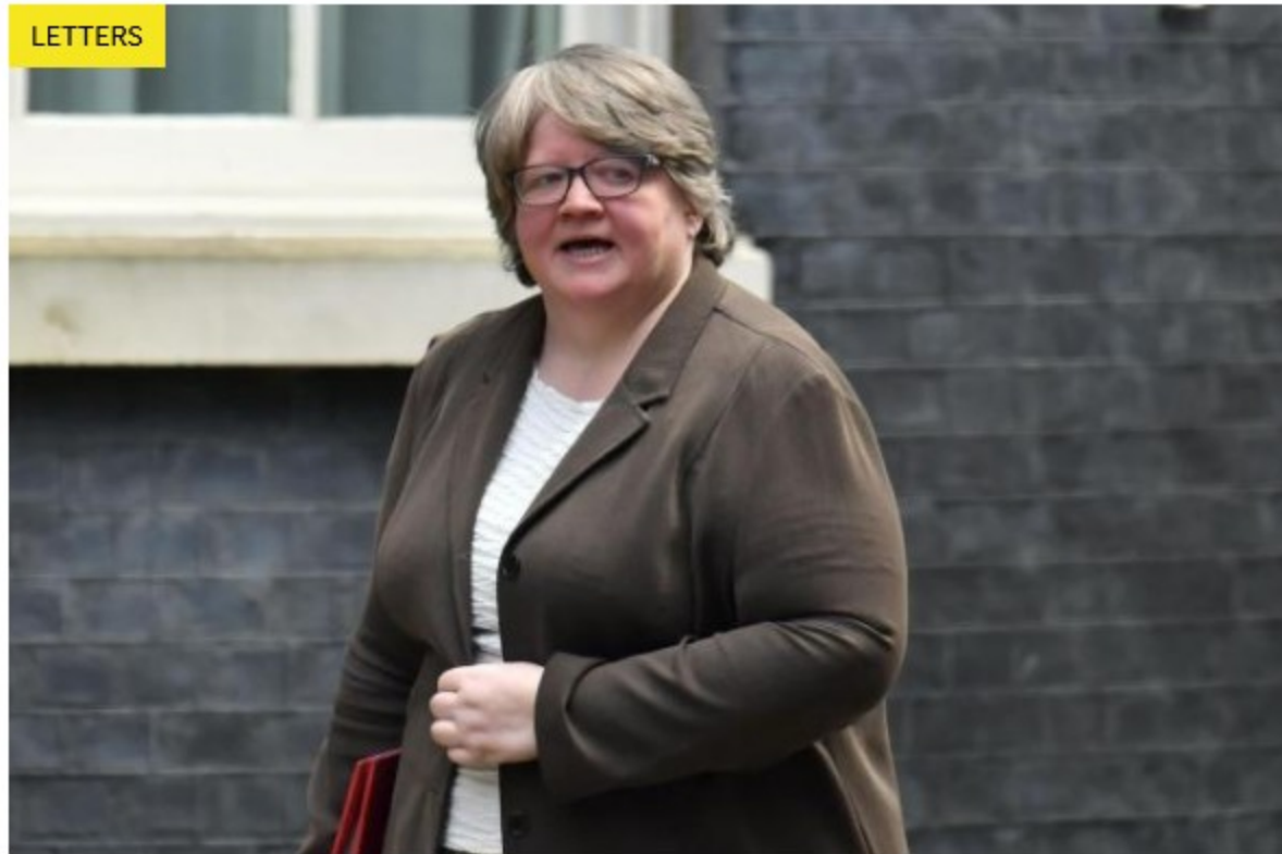
Work and Pensions Secretary Therese Coffey has compliantly performed a volte-face