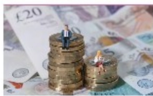
Young women 'must work 40 years longer

The research, based on data from 4 million L&G pension scheme members, found that the typical gender pension gap is 17% at the beginning of women’s careers and increases to 56% at retirement compared with men.