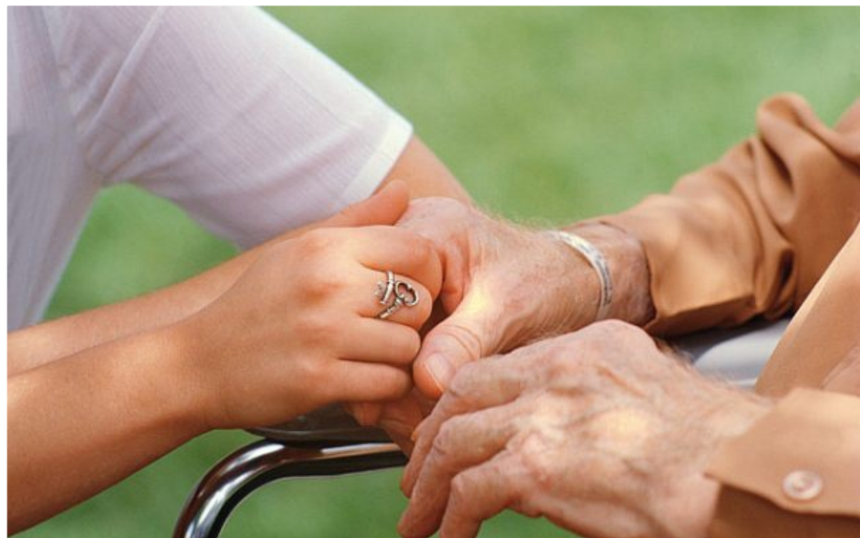
Nurse Holding Elderly Patient's Hand

Jewish Care has said 68 residents suspected of having contracted Covid-19 have recovered, with “more consistent” testing now being rolled out across the charity.