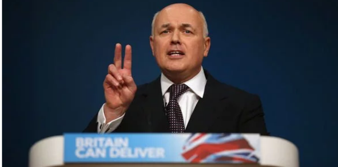
A No10 spokeswoman said the proposal was not Government policy