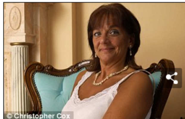
Pensions campaigner Ros Altmann

Pensions campaigner Ros Altmann has become chairman of financial tech firm Pensionsync. The 62-year-old was director general of over-50 specialist Saga from 2010 to 2013 and a Conservative pension minister from 2015 to 2016. Pensionsync is a London company which builds software that aims to make it easier and cheaper for firms to deal with auto-enrolment on staff pension schemes.